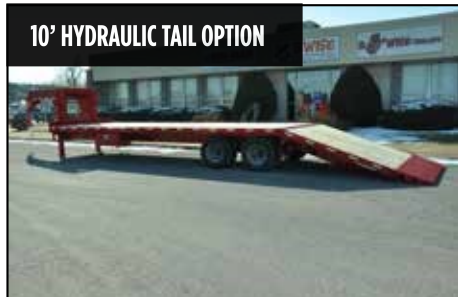
10' HYDRAULIC TAIL OPTION