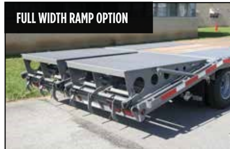
FULL WIDTH RAMP OPTION

NEED TO HAUL SOME SERIOUS WEIGHT? OUR 23,000 LB DUAL WHEEL DECKOVER UNITS ARE READY FOR THE TASK...AVAILABLE IN 25,990 LB ALSO.